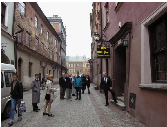
Grodzka Street in Lublin