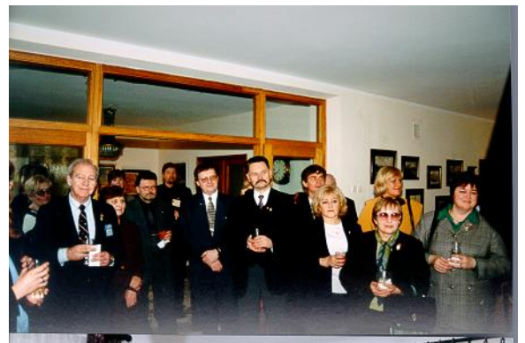
Guests at the Ambassador's residence