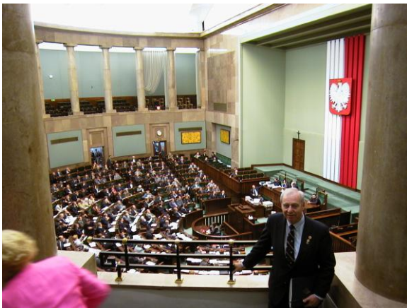
Sejm the Lower House of Polish Parliament