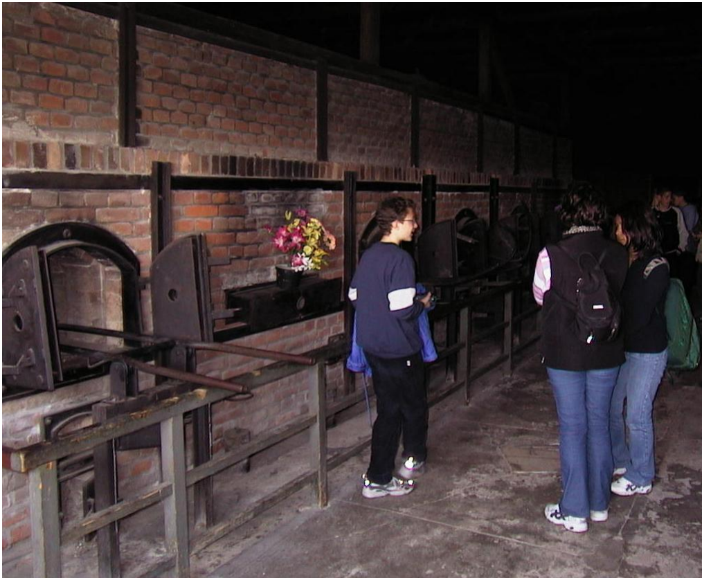
Israeli students visiting the ovens at Majdanek, which consumed 1,000 bodies a day,

Europe, where thousands of ordinary people of many creeds and nationalities were systematically exterminated. It would be difficult to match the profoundly moving and soul shattering experience of our chilling day at Majdanek. Surely this was man's inhumanity to man in its basest form.