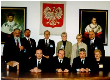
Lublin Medical Academy

Following the horror of that war, Lublin played the role of temporary capital of Poland. It became an important university center, with the Medical Academy, the University of Maria Skłodowska-Curie, the Academy of Agriculture, the Lublin Institute of Technology, and the renowned Catholic University of Lublin. Indeed, one of the great mysteries of Poland today is the “miraculous” survival of this prestigious Catholic institution during the most oppressive decades of Soviet totalitarianism.