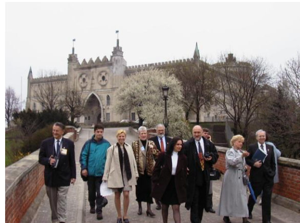
Lublin castle built in 13 th century