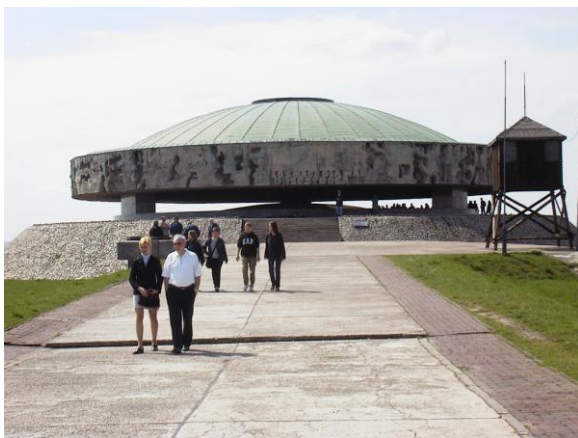
The ashes of the victims of Majdanek