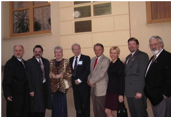
Windsor Delegation, and Z. Wojciechowski, Deputy Mayor of Lublin With Windsor's plaque at Lublin City Hall