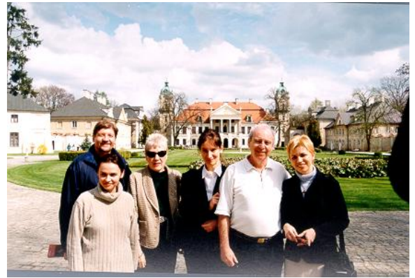
The Zamoyski Museum in Kozlowka