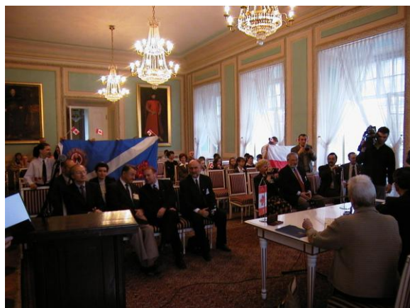
The witnesses to the signing