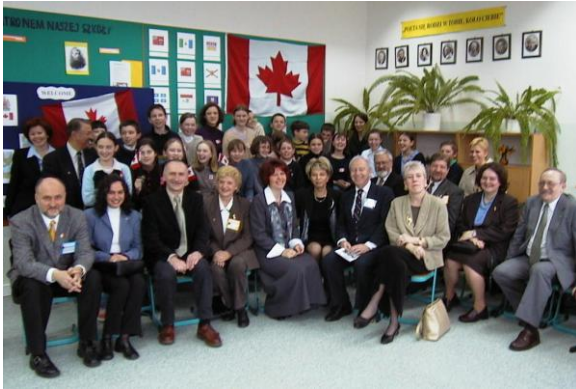
Elementary Cardinal Wyszyński School Number 50 in Lublin