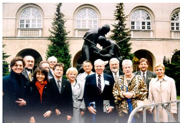
The quadrangle of the Catholic University of Lublin