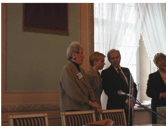
Translating the speeches