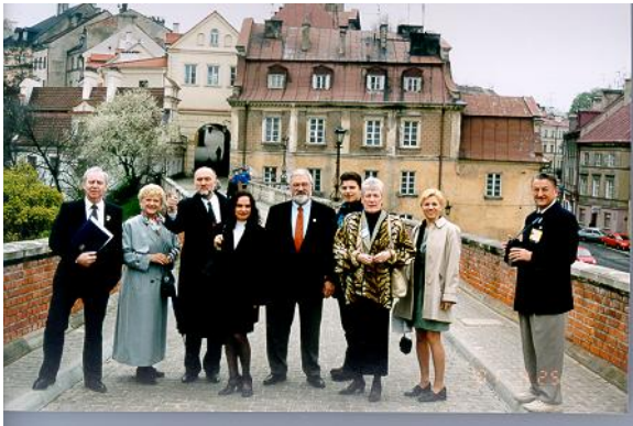
The bridge to the old City Gate