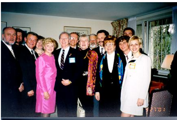
At the Canadian Ambassador's residence in Warsaw