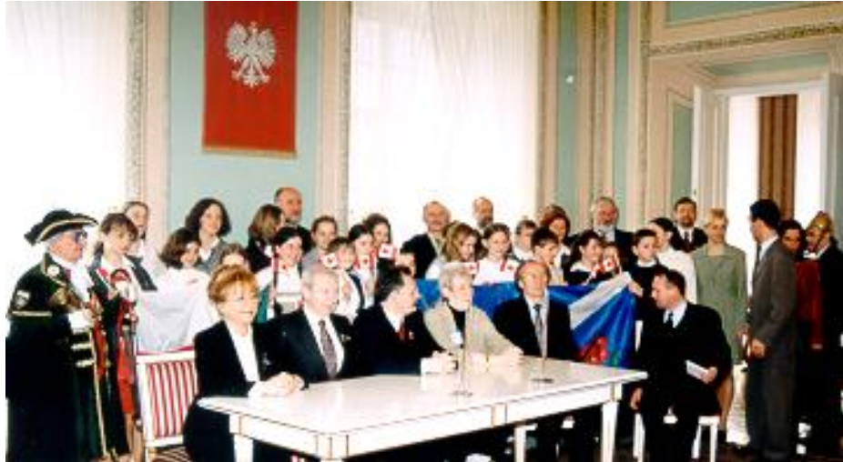
The Signing Ceremony

On the 25 th day of April 2001, in the elegant and stately former Royal Supreme Court of Poland, the formal protocol for the Twin-City Agreement between Windsor, Ont. Canada, and Lublin, Poland, was officially executed.