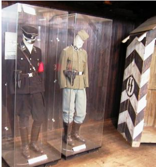
SS Uniforms Majdanek

Social and economic life flourished during the Renaissance, with the appearance of many national and religious minorities enjoying freedom and tolerance. However, numerous wars with the Cossacks, and the Swedish Invasion Army in the 17 th Century brought an end to the prosperity. The decline continued throughout the 18 th Century when Poland suffered three partitions effected by Russia, Prussia, and Austria.