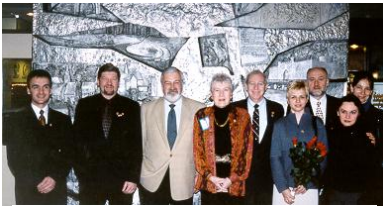
Lobby of Unia Hotel

A two and one-half hour scenic drive from Warsaw brought us to Lublin at 4:15 pm, about 20 hours after leaving Windsor.