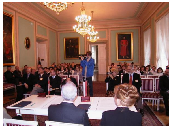
The Gold Room in the Former Royal Supreme Court Building