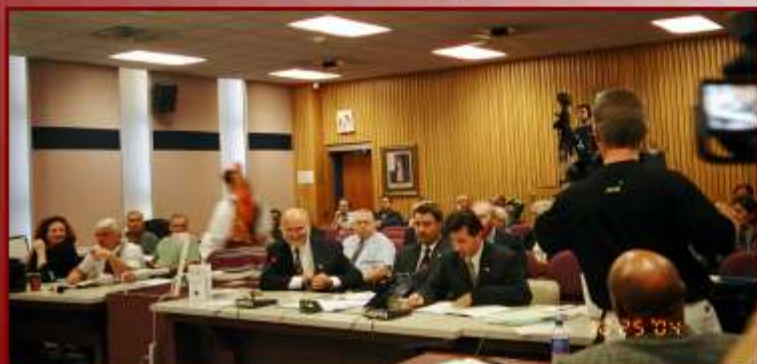
4. Proclamation of Polish Week in City Chambers.