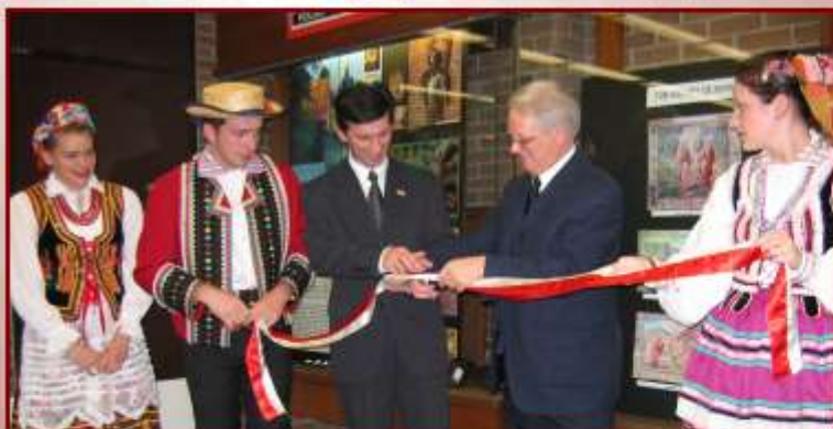
2. Opening of Polish Exhibition at University of Windsor.