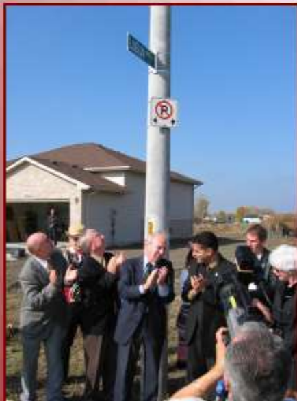
3. Naming of new street "Lublin Ave." in Windsor .