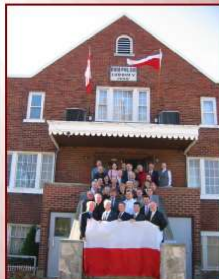
8. Participants in Polonia community lunch, in front of Dom Pol-