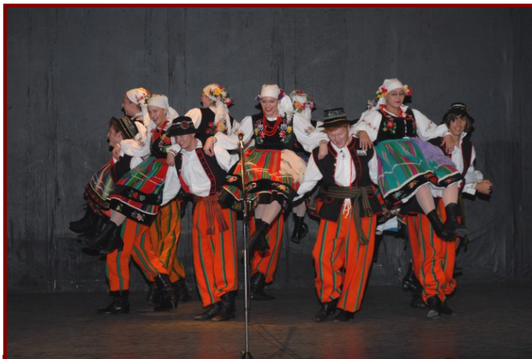
13. Oldest Group of the Tatry Song & Dance Ensemble performs a Suite from the Opoczno-Łowicz region.