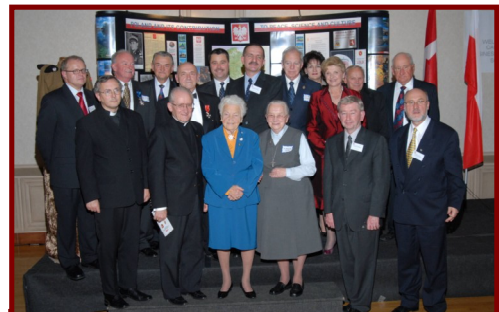
11. Guests and Individuals honoured at the Business Dinner.