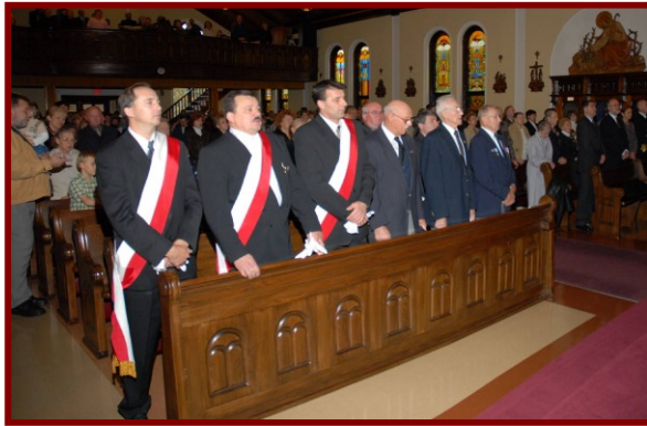
1. Holy Mass at the Holy Trinity Polish Church.