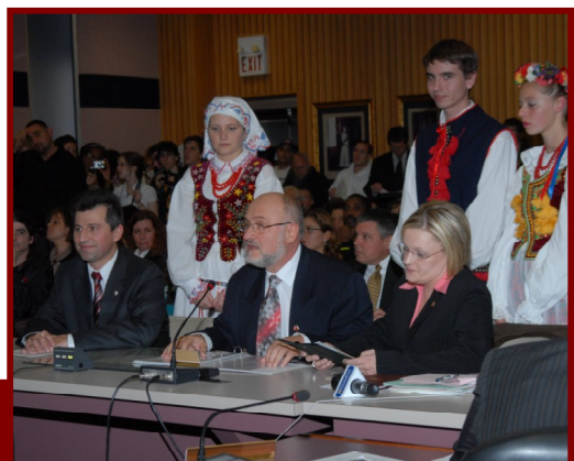
6. Delegation at the Windsor City Council Meeting, during the Proclamation of Polish Week in Windsor 2006.