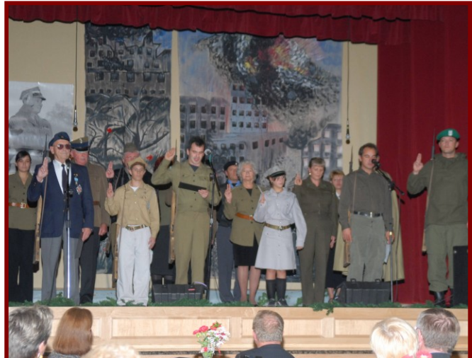
4. Vocal and Theatre Group Piłomień performs at a Banquet held at Dom Polski Hall on Sunday.