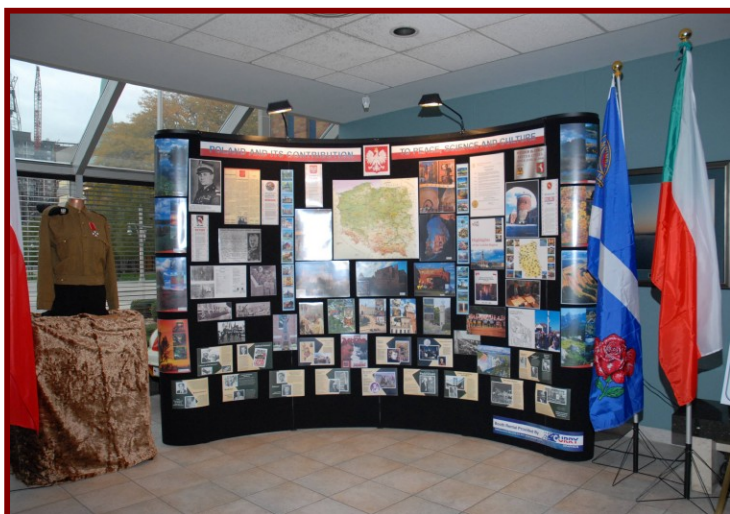
5. Exhibition at City Hall, illustrating Poland's contribution to world peace, science and culture.