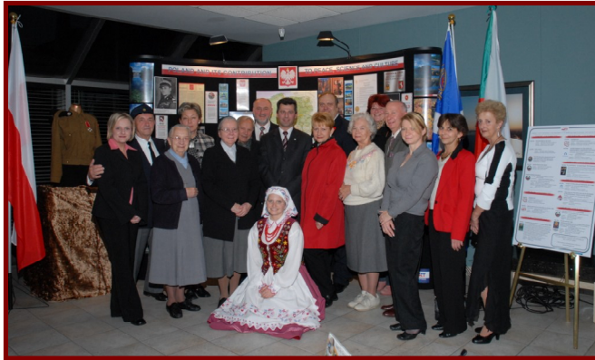
7. Part of the PWW 2006 Organizing Committee in front of the Exhibition at City Hall.