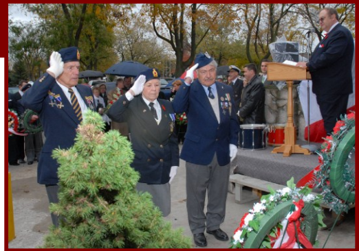
2. Veterans presenting wreaths at a commemorative plaque in front of Dom Polski Hall.