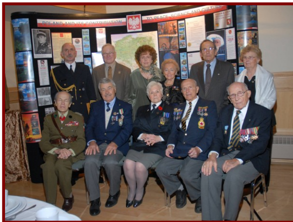
3. Veterans in front of an Exhibition at Dom Polski Hall during the Sunday Banquet.