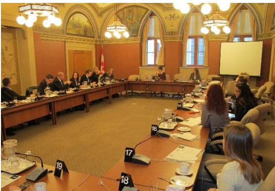
IN CONVERSATION WITH MEGAN LESLIE, NDP DEPUTY LEADER AND ENVIRONMENT CRITIC

And our day truly was jam-packed with action. After being ushered in through