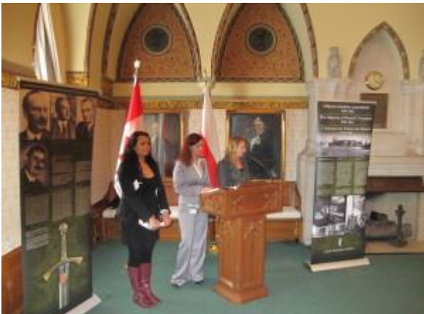
LEADERS OF THE POLISH STUDENTS' ASSOCIATION AT THE UNIVERSITY OF TORONTO, PISK, AND YPCPA

No visit to the Hill would be complete without sitting in on Question Period. This is where those biting one-liners and comebacks that grace our evening news unfold live. The issue of the day seemed to be employment insurance reform, with the Hon. Minister of Human Resources and Skills Development, Diane Finley, being called upon frequently to answer questions from the Opposition.