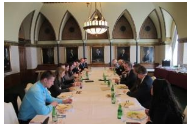
LUNCHEON HOSTED BY JOE COMARTIN, MP, DEPUTY SPEAKER OF THE HOUSE OF COMMONS