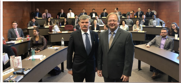
Lecture to students at the Odette School of Business, University of Windsor.