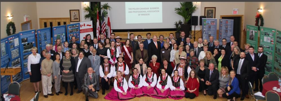
A picture from the 22 nd Annual Polish-Canadian Society Business Dinner in 2017

The 23 rd Annual Polish-Canadian Society Business Dinner will take place on Friday, November 23, 2018, at the Dom Polski Hall, 1275 Langlois Avenue, Windsor.