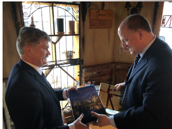
Meeting with Drew Dilkens, Mayor of Windsor. Lunch at the Spago Restaurant 690 Erie St. E .