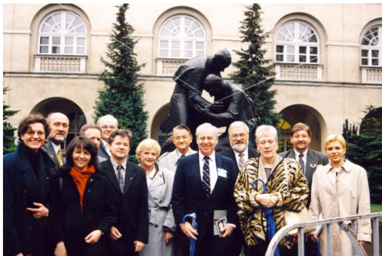
Photograph #5- Windsor delegation in courtyard of Catholic U. of Lublin, with staff of International Office, Lublin, 24 April 2001.