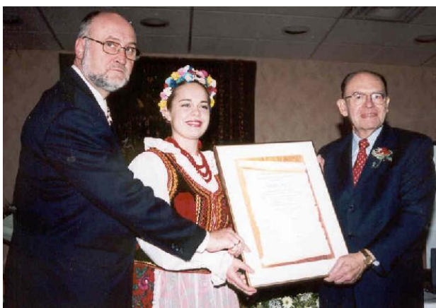
Photograph #7- Herb Gray receives acknowledgement from Polonia, during Polish Week in Windsor 2002, University of Windsor, 20 November 2002.