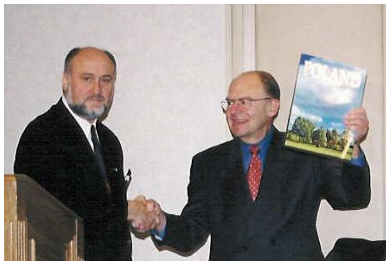
Photograph #11- Herb Gray, Guest Speaker at VI Annual Meeting of Polish Canadian Business and Professional Association of Windsor, receives book about Poland from organization's President, 2 November 2000.