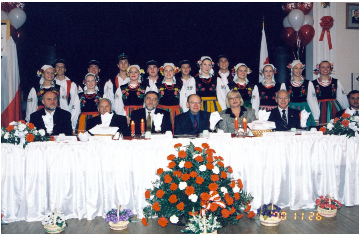
Photograph #8- Herb Gray presents greetings from Jean Chrétien, Prime Minister of Canada, at celebration of 75 th Anniversary of Dom Polski in Windsor, 25 November 2000.